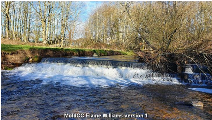
Waterfall by Elaine Williams, taken on her mobile phone that day. She made some alterations "live" based on the critique offered.

An upside to doing this online was that several members edited their images whilst the session was still going on and were able to show us the changes that had been suggested so that we could decide if those changes were justified or not. Some of these photographs are shown below.